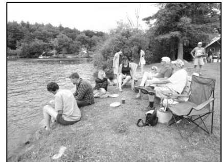
"Take Tinmouth to the Lake"