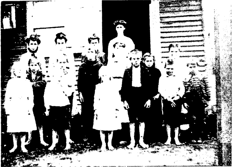
"NORTH LANDGROVE" SCHOOL 1903

PLEASE BRING THIS REPORT TO TOWN MEETING