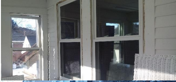
Project Site Visit #2: James St. St. Johnsbury to include 13 windows, re-roof main house roof and more.