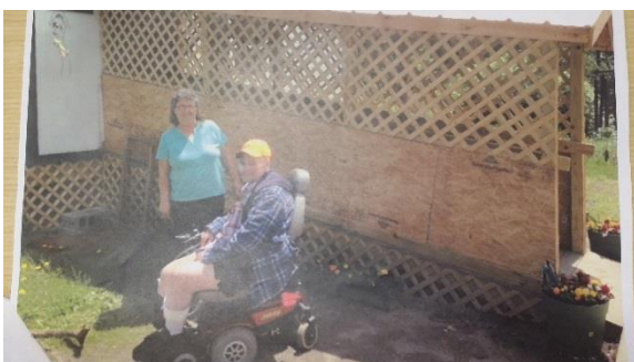
Project Site Visi#1: Concord, VT Happy Homeowner with new access ramp, new pellet stove and portable ramp.