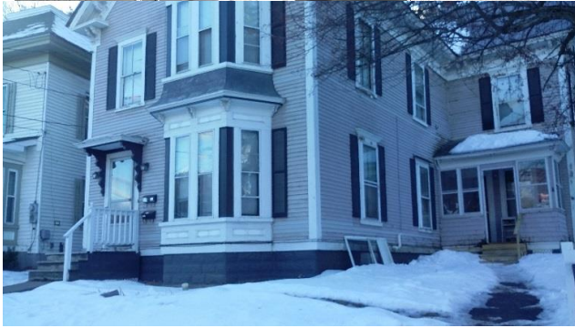
Project Site Visit #3: Pearl St., St. Johnsbury to include Historic exterior doors, 15 windows and more.