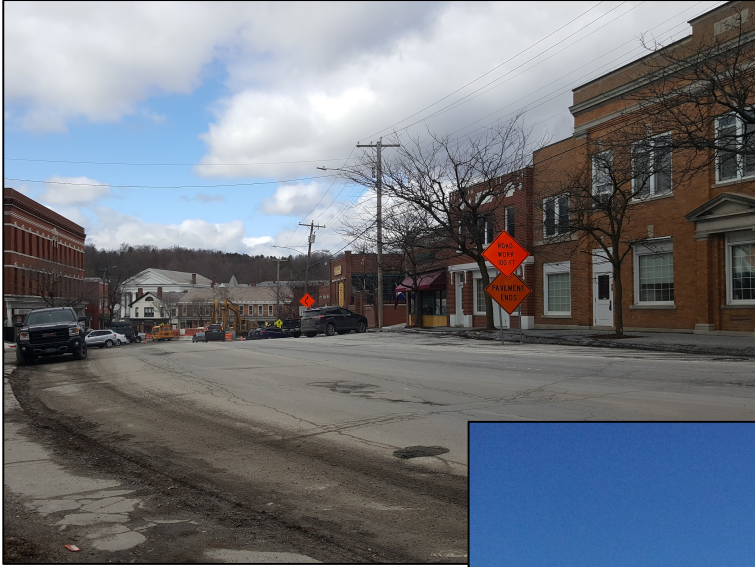
Center Street, Before and After