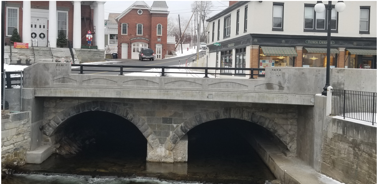
Bridge 114 Rebuild