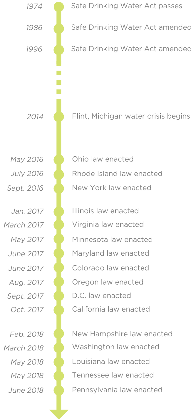
Figure 2. Timeline of State Laws Profiled and Related Key Dates

Appropriates annual funding for two years to pay for voluntary testing of drinking water fixtures in public schools for the presence of lead. Priority is given based on age of children attending, age of buildings, and the date of last test. It also requires the Department of Health to develop guidance and testing protocols that include actions to take if the federal action level is exceeded, recommendations to schools on prioritizing fixture replacement, and recommendations for communicating test results to parents and the community.