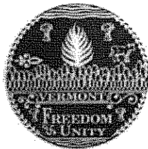
Peter Shumlin Governor

Given under my hand and the Great Seal of the State of Vermont on this 18th day of May, A.D. 2016