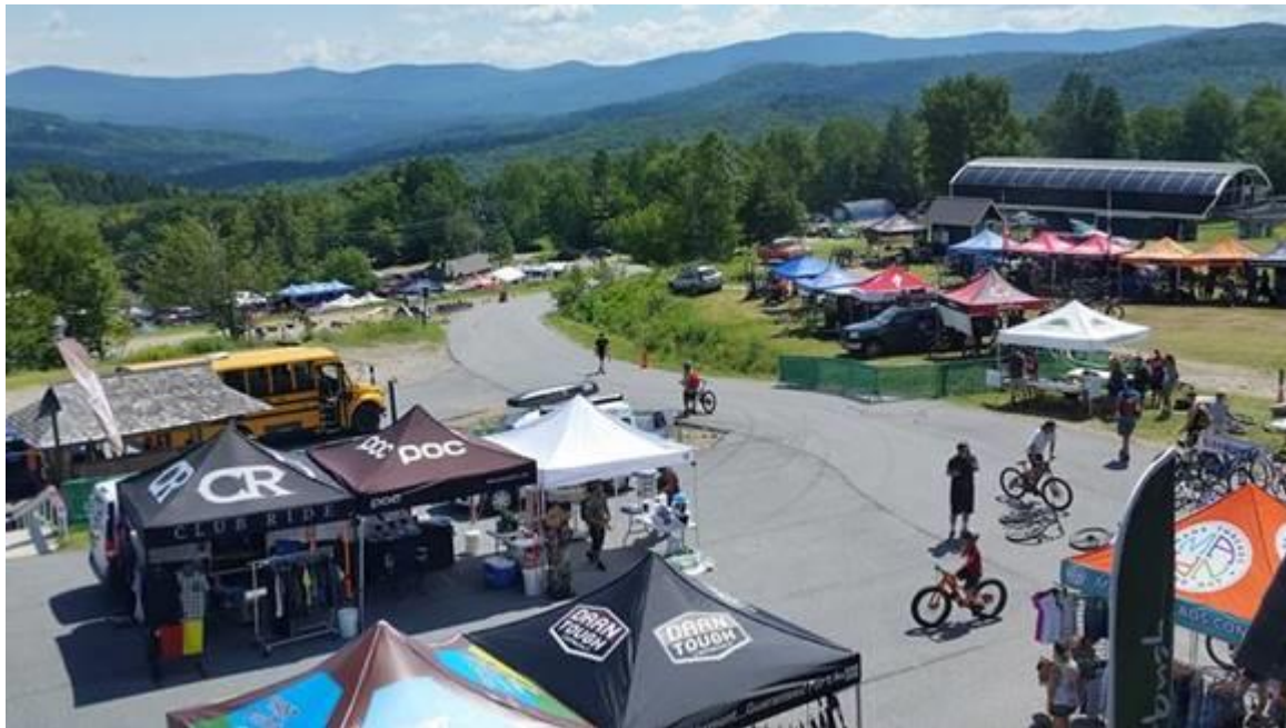
• Scene from the 2016 Vermont Mountain Bike Festival