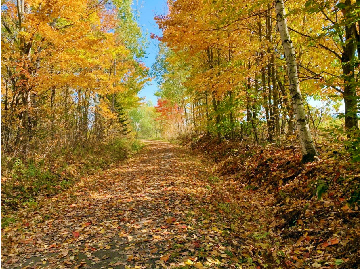
Danville Rail Trail