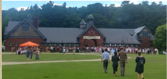
Open Farm Week promotions at the Vermont Fresh Network's 20 th Anniversary Forum Dinner at the Coach Barn at Shelburne Farms