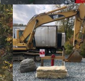
West Pawlet - Loomis VT Route 149