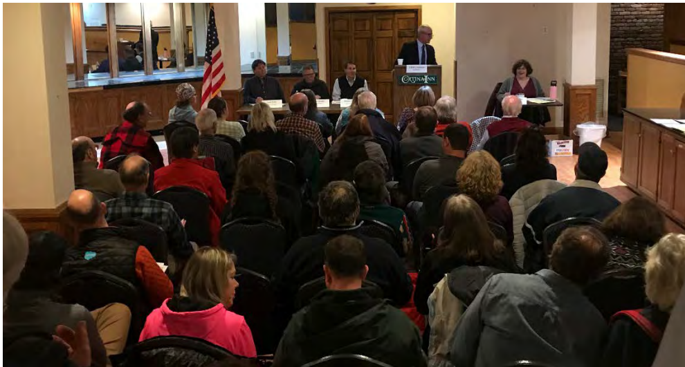
Town Meeting at the Cortina Inn March 2019

A copy of the annual audit can be obtained at the Town of Mendon Office or on the Town's website www.mendonvt.org .