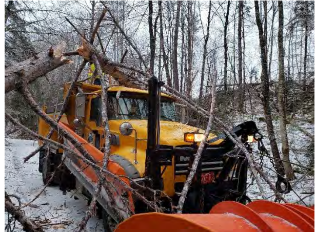
Tree fell on Truck #1 December 30, 2019