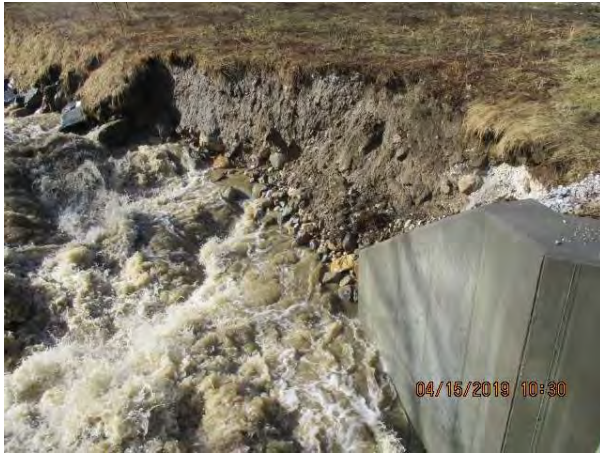
Bridge 25 Medway Road April 2019 Disaster