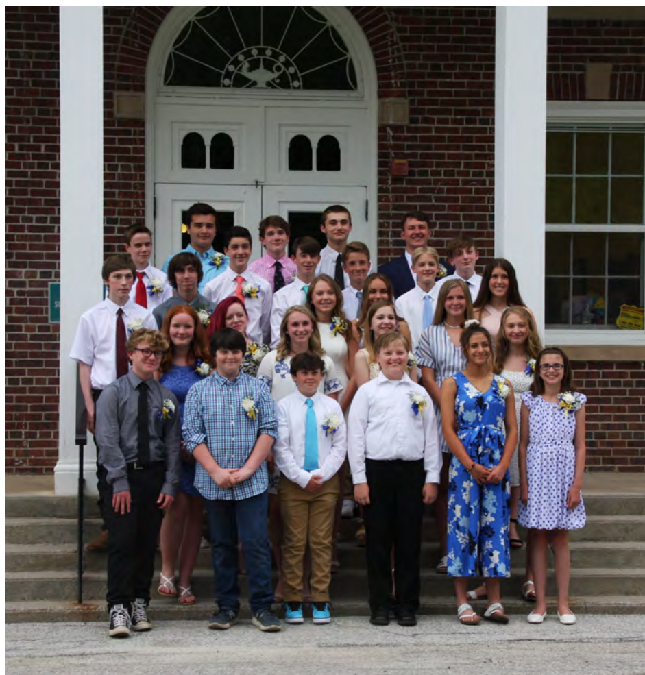
Barstow Graduating Class of 2019

of General E.H. Ripley's Residence.