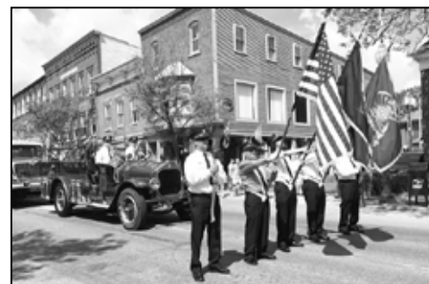
We maintain Woodstock's first fire engine, a 1923 Maxim, restored and owned by the Woodstock Firefighters' Relief Association for community events like the Memorial Day parade. We keep a part of our shared historical heritage alive.