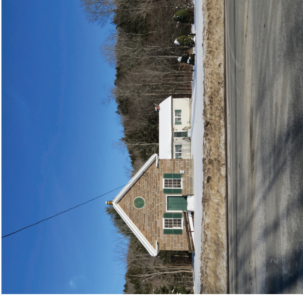
PROSPER Prosper Schoolhouse