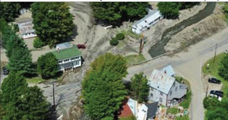
Town of Rochester – Buyout before and after of multiple properties on Route 100