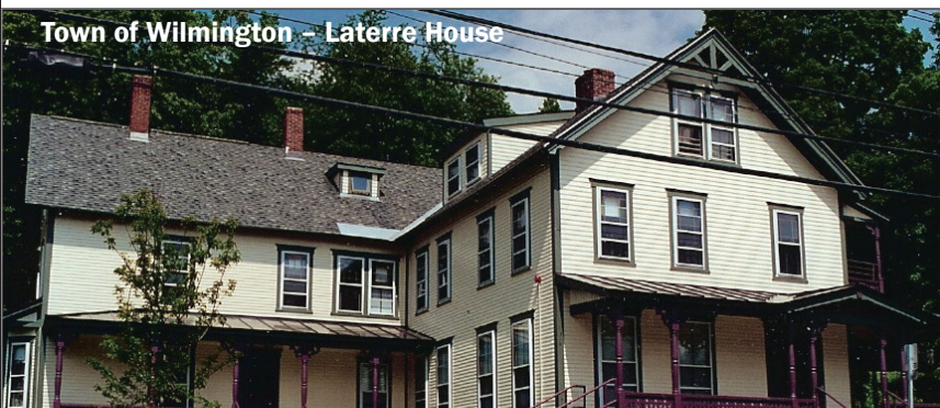
Town of Wilmington – Laterre House