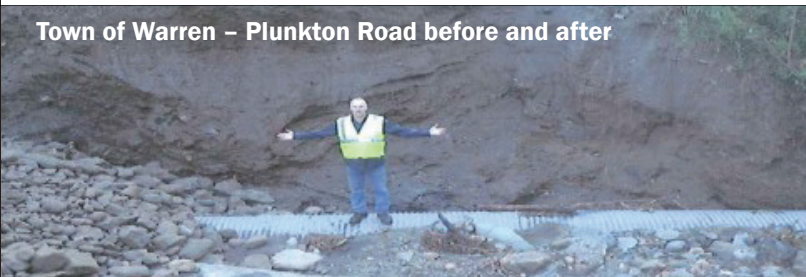
Town of Warren – Plunkton Road before and after