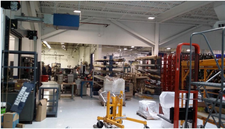
347 John Seitz Drive- Completed Interior Expansion