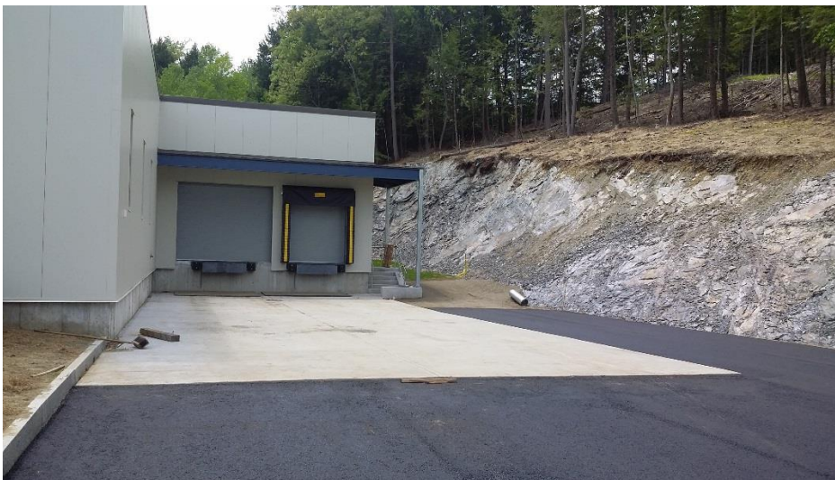
347 John Seitz Drive- Rear Exterior Expansion