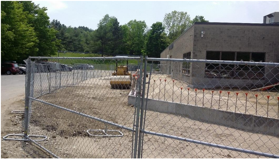
101 John Seitz Drive- Acquisition and Expansion