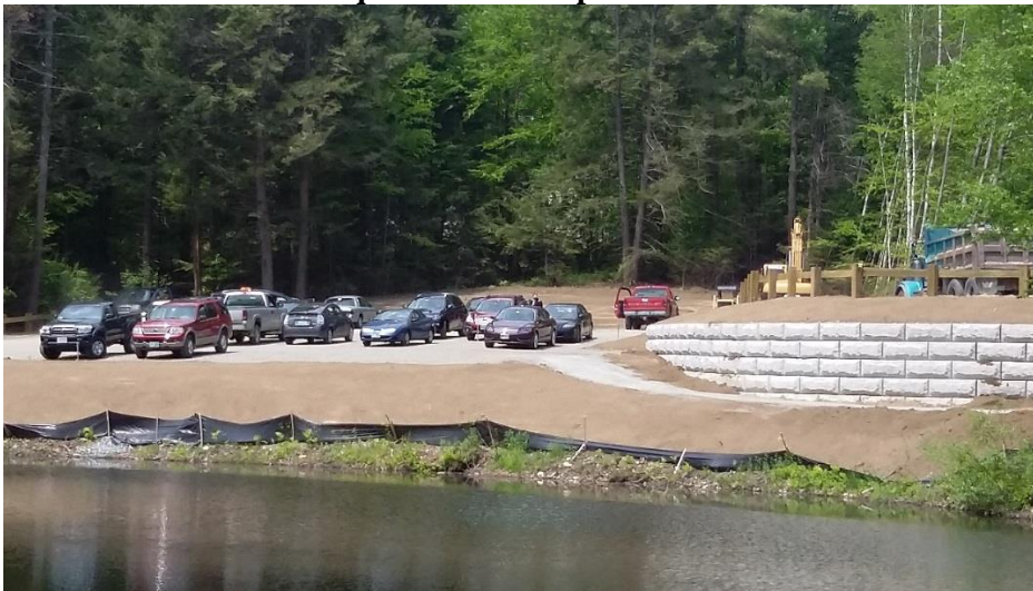
101 John Seitz Drive- Parking Lot Expansion