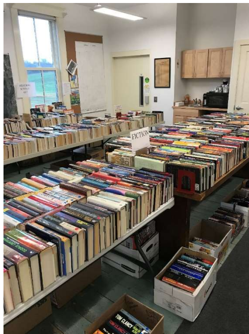
The Cornwall Library 2021 book sale.