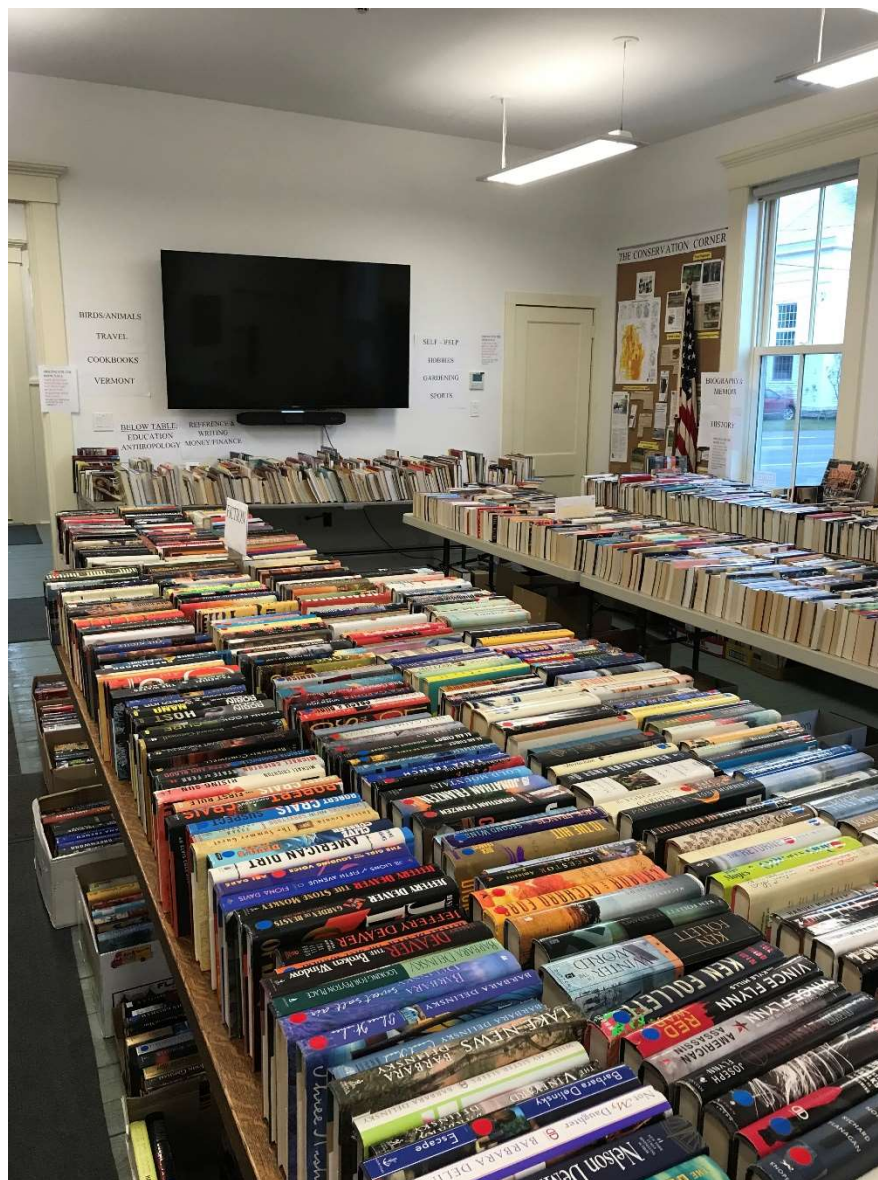
The Cornwall Library 2021 book sale & new Video Screen