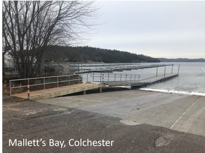
Mallett's Bay, Colchester