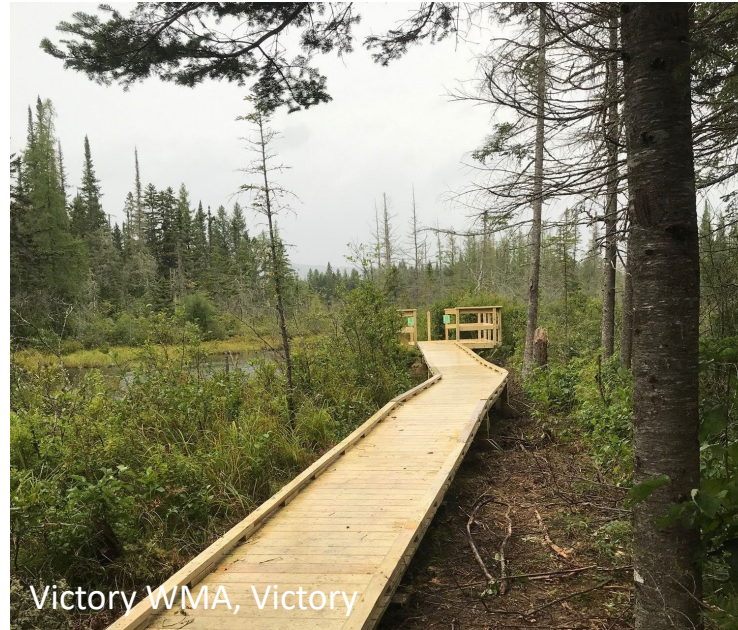
Victory WMA, Victory