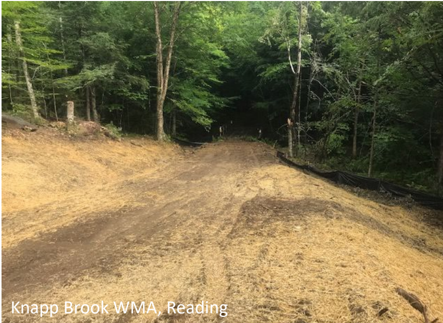
Knapp Brook WMA, Reading