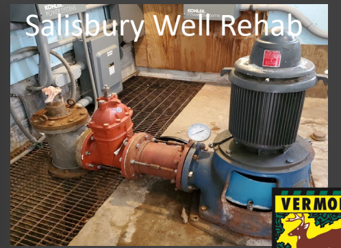
Salisbury Well Rehab