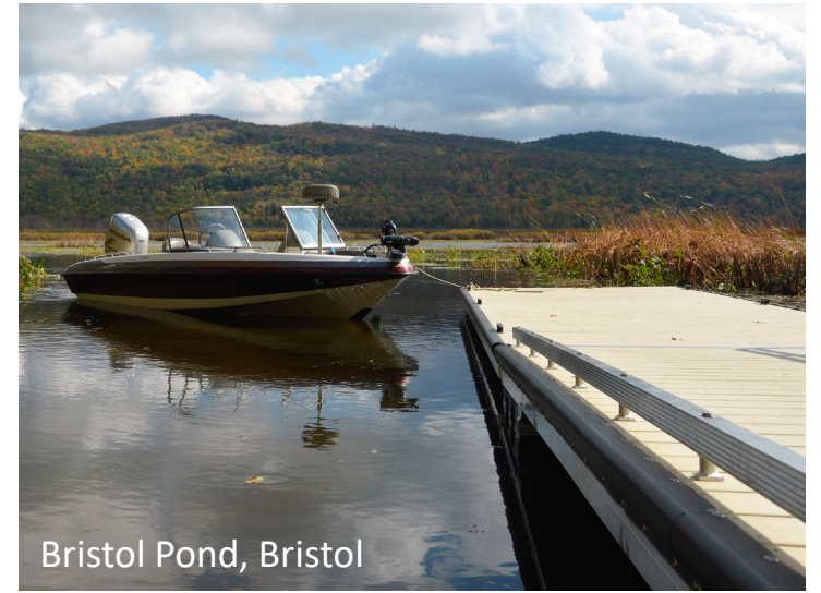
Bristol Pond, Bristol