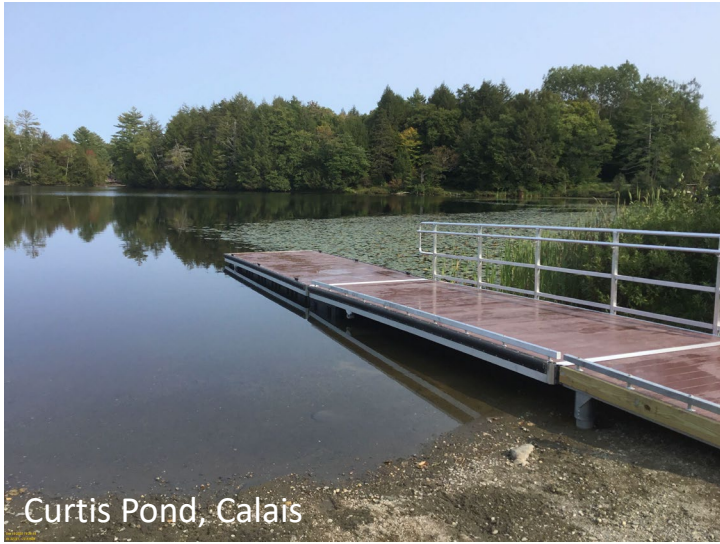
Curtis Pond, Calais