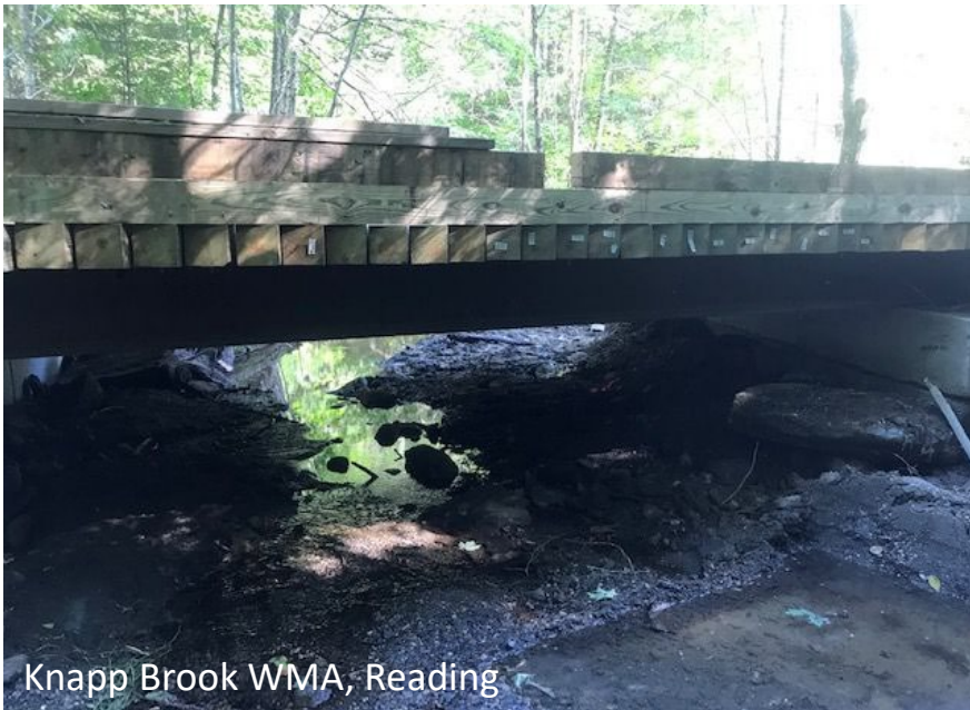
Knapp Brook WMA, Reading