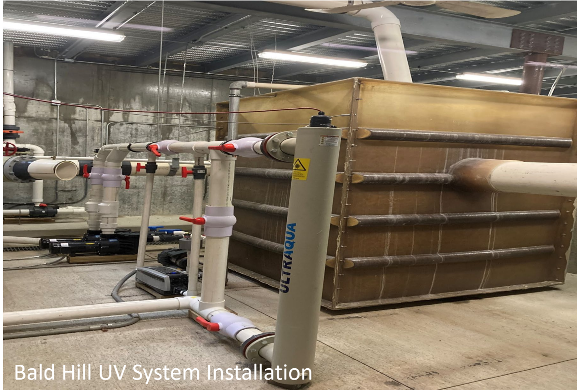
Bald Hill UV System Installation