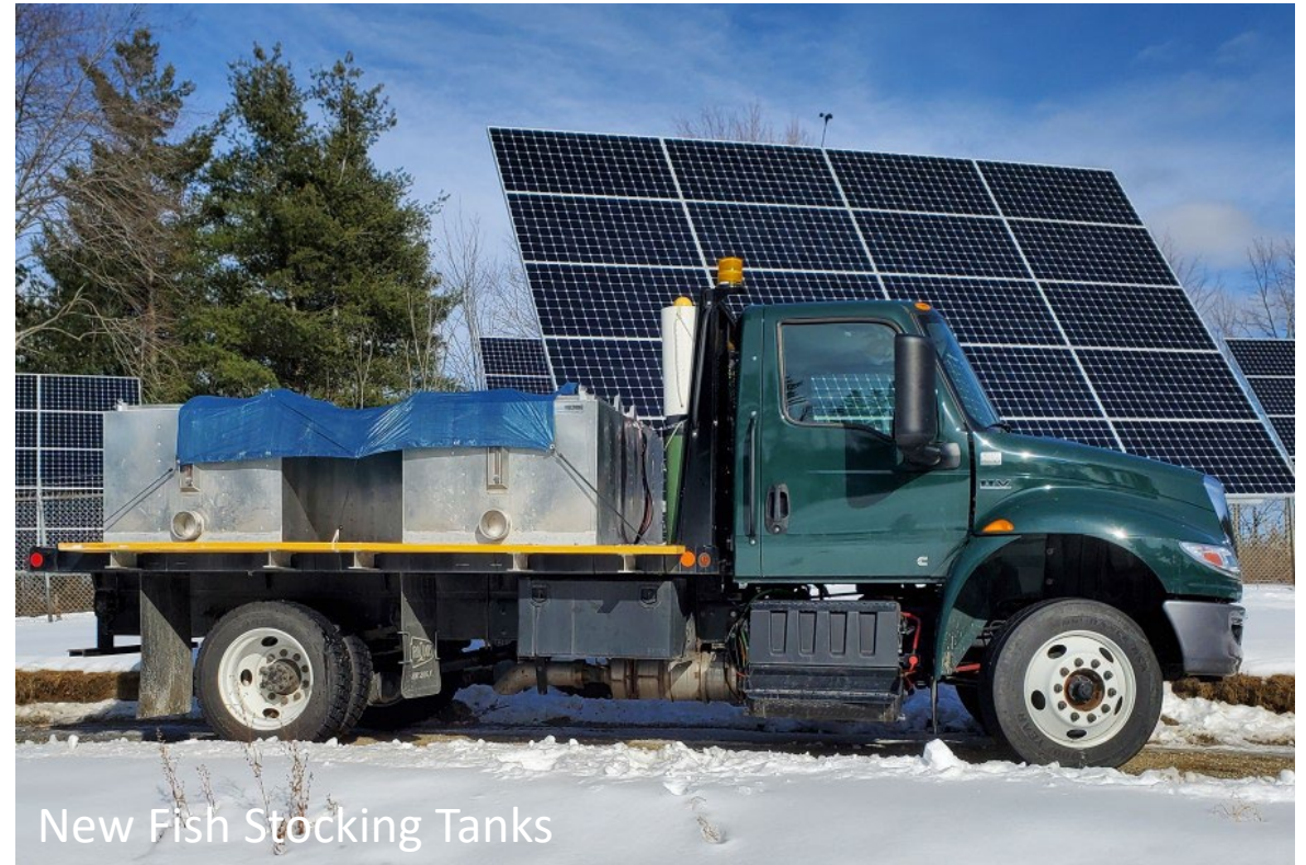
New Fish Stocking Tanks