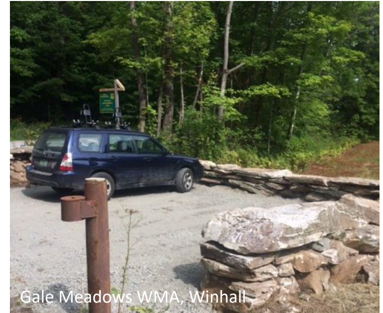
Gale Meadows WMA, Winhall