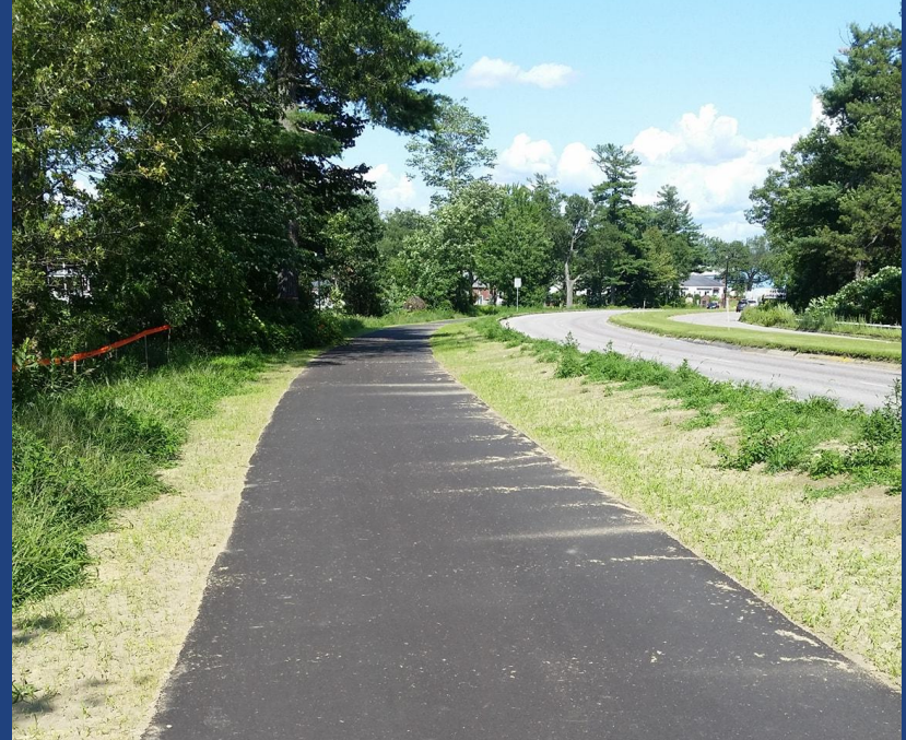
Shared use path being built along Route 15 in Colchester