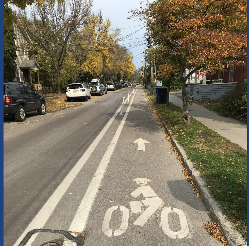
N. Union Street, Burlington