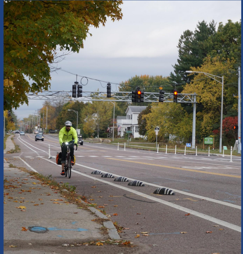
North Avenue, Burlington