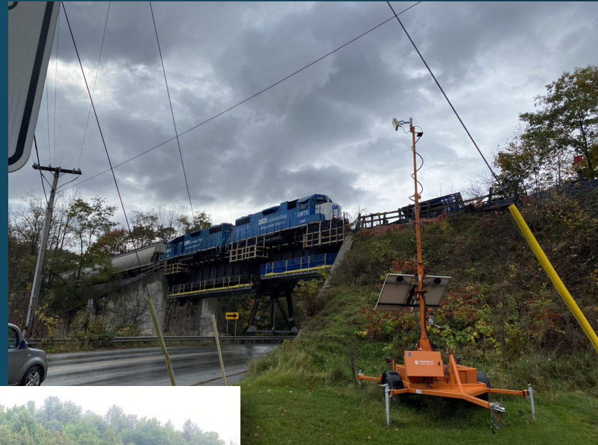
Newbury, Bridge 522