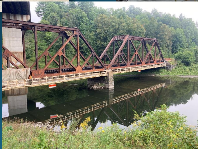
St. Johnsbury, Bridge 538