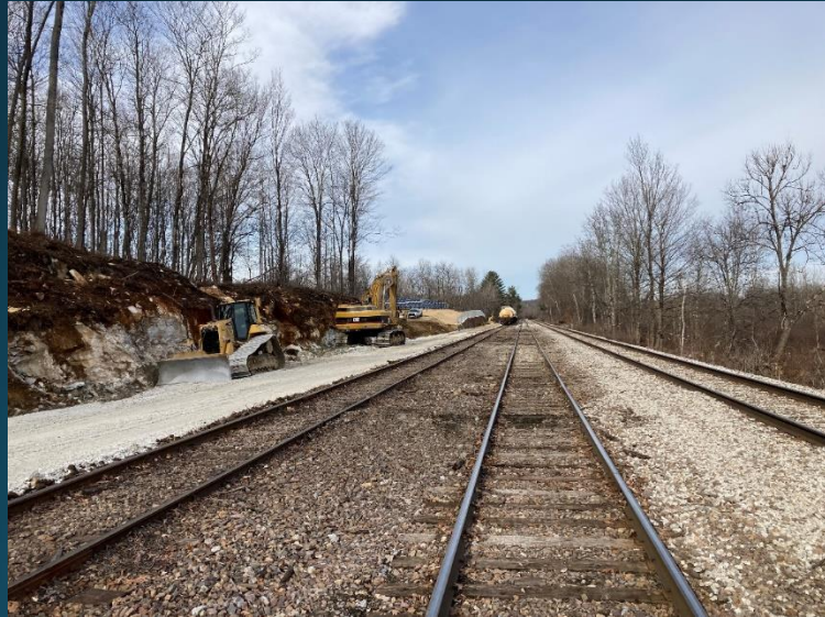
Pittsford (Florence) Siding