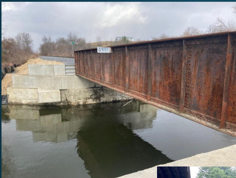
Coventry, Bridge 562