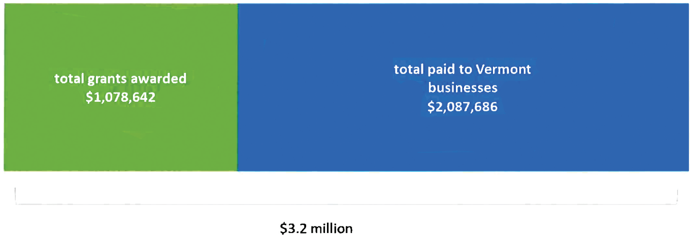
all businesses supported

For every $1 granted, more than $2 are invested into the local economy.