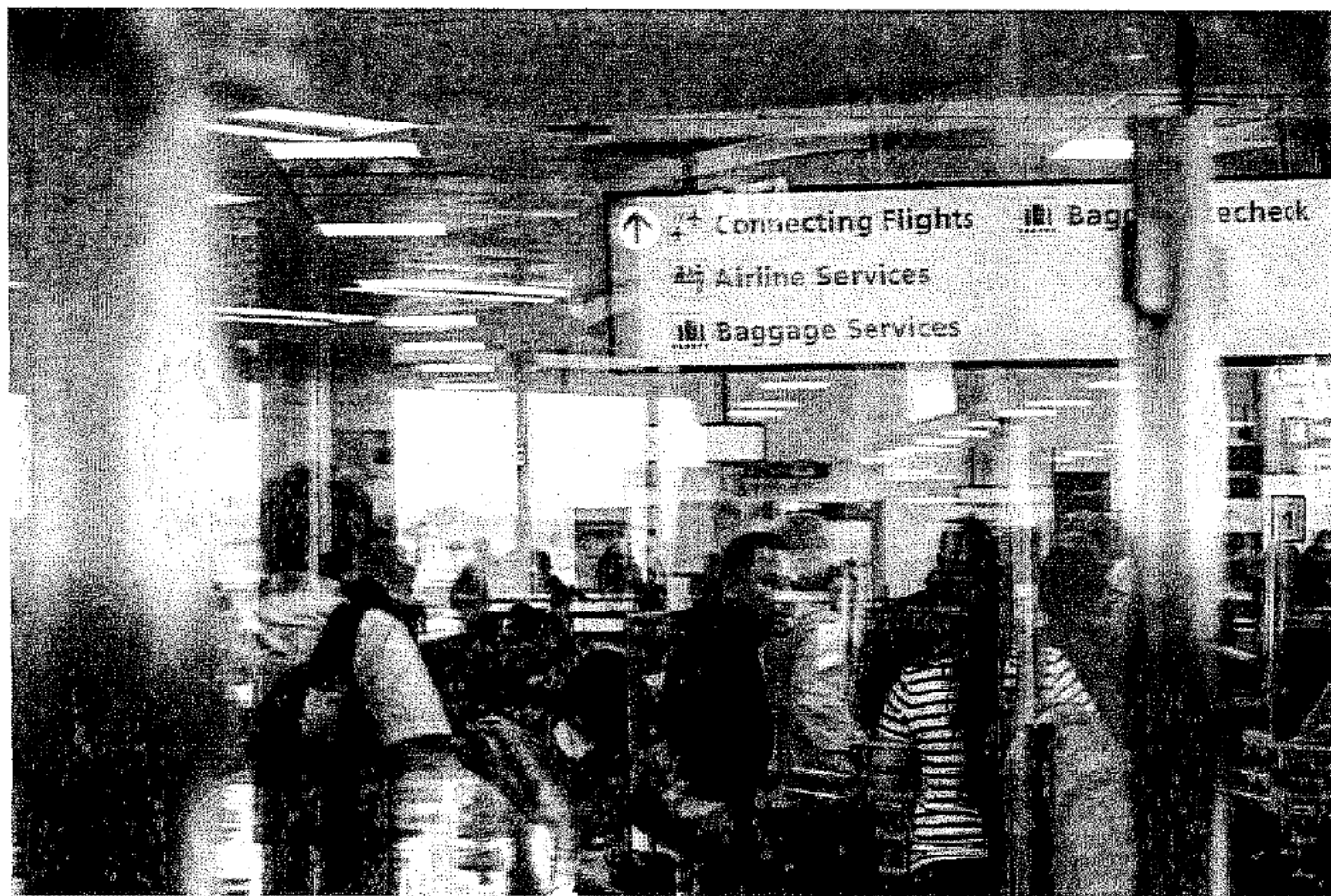
Passengers passing through U.S. Customs at Newark Liberty International Airport on Sunday.

It was nearly 100 years ago that an influenza pandemic led to sweeping quarantines in American cities, and it was more than two decades ago that patients in New York were forced into isolation after an outbreak of tuberculosis.