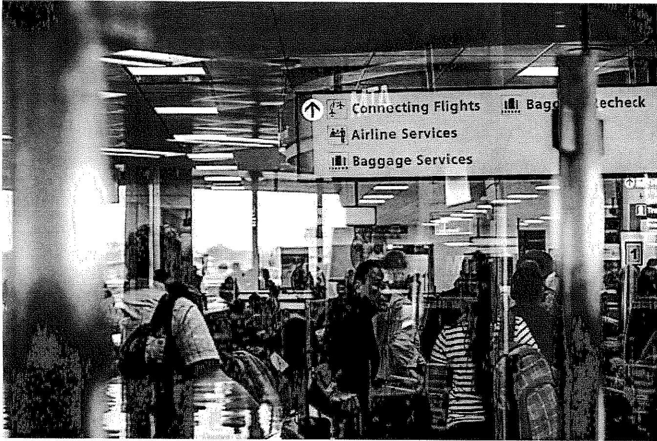
Passengers passing through U.S. Customs at Newark Liberty International Airport on Sunday.

It was nearly 100 years ago that an influenza pandemic led to sweeping quarantines in American cities, and it was more than two decades ago that patients in New York were forced into isolation after an outbreak of tuberculosis.