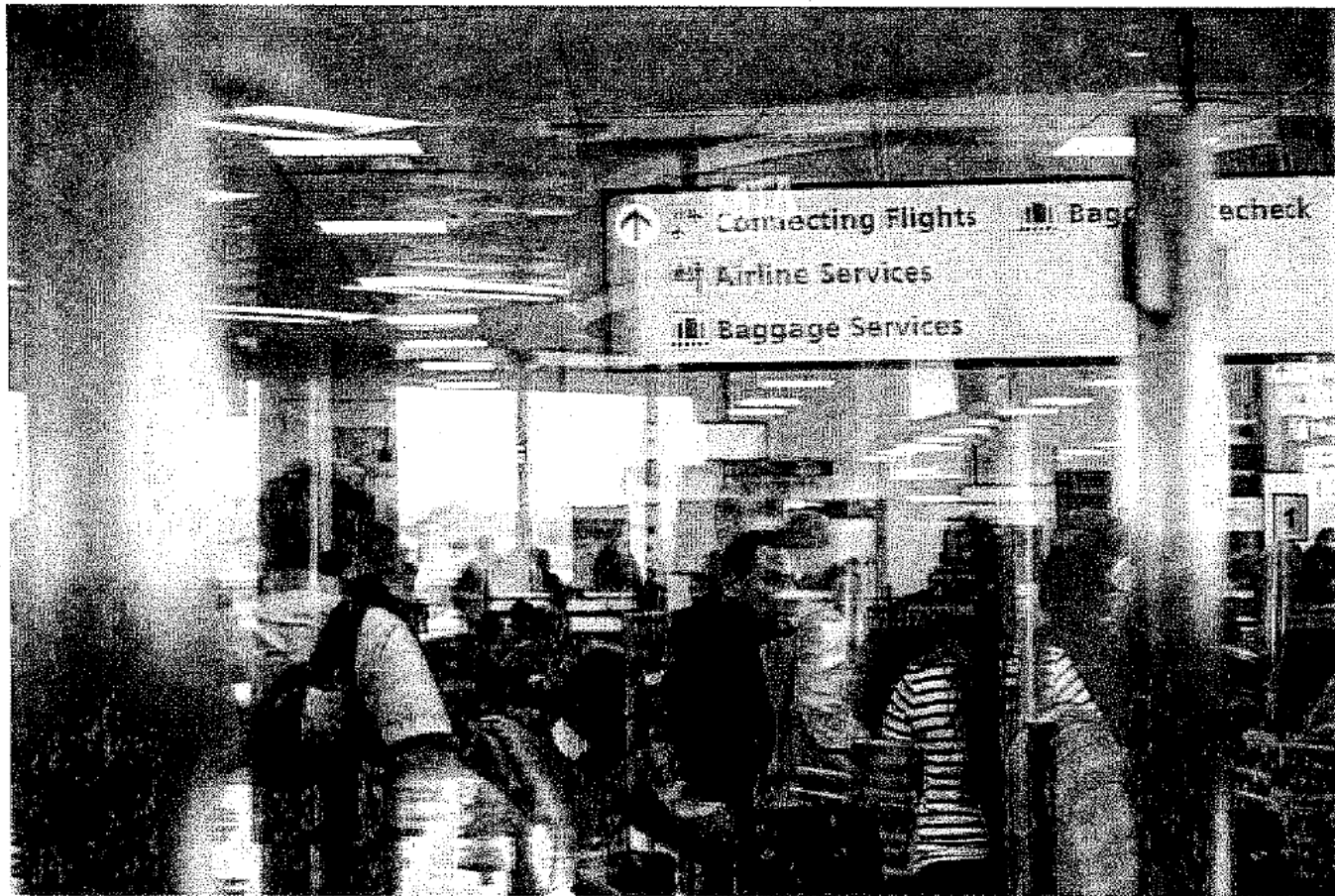
Passengers passing through U.S. Customs at Newark Liberty International Airport on Sunday.

It was nearly 100 years ago that an influenza pandemic led to sweeping quarantines in American cities, and it was more than two decades ago that patients in New York were forced into isolation after an outbreak of tuberculosis.