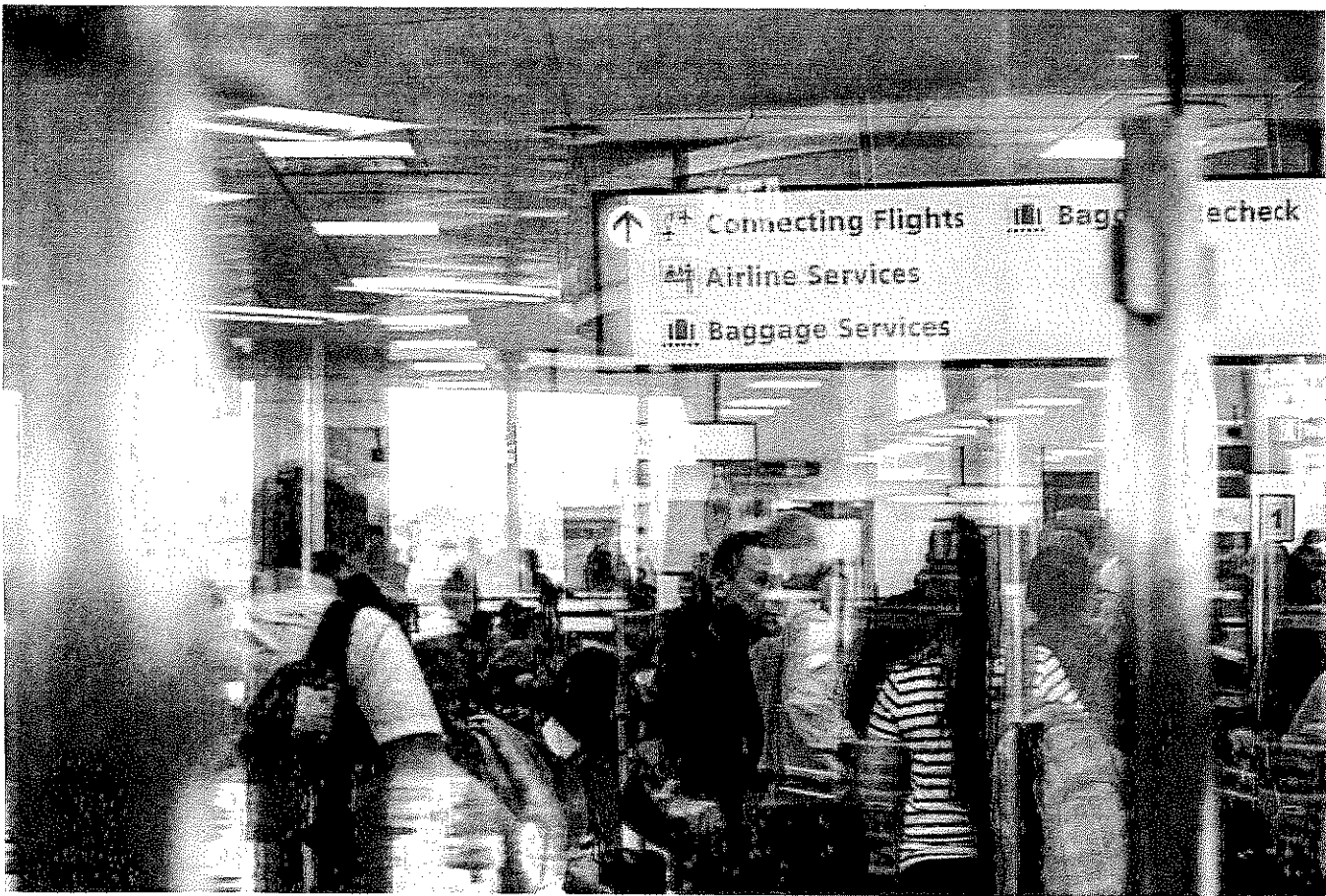
Passengers passing through U.S. Customs at Newark Liberty International Airport on Sunday.

It was nearly 100 years ago that an influenza pandemic led to sweeping quarantines in American cities, and it was more than two decades ago that patients in New York were forced into isolation after an outbreak of tuberculosis.