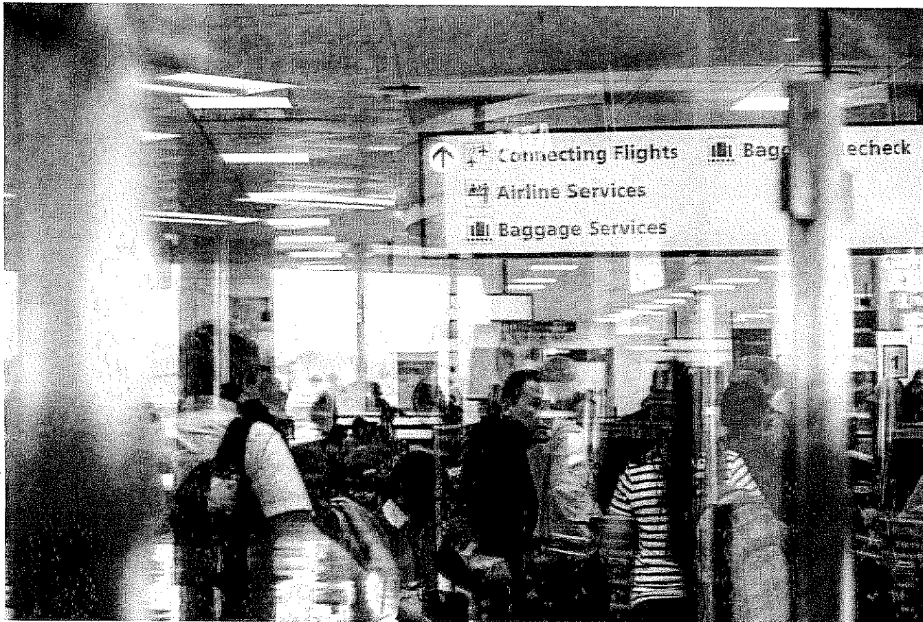
Passengers passing through U.S. Customs at Newark Liberty International Airport on Sunday.

It was nearly 100 years ago that an influenza pandemic led to sweeping quarantines in American cities, and it was more than two decades ago that patients in New York were forced into isolation after an outbreak of tuberculosis.