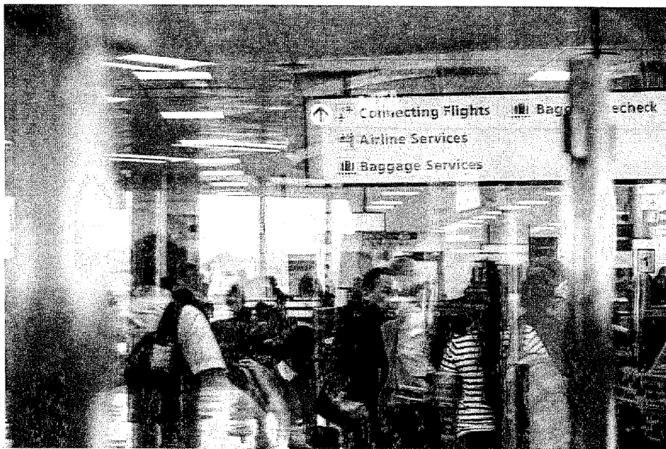
Passengers passing through U.S. Customs at Newark Liberty International Airport on Sunday.