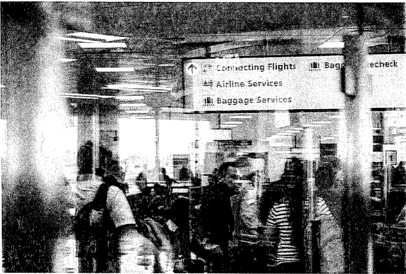
Passengers passing through U.S. Customs at Newark Liberty International Airport on Sunday.

It was nearly 100 years ago that an influenza pandemic led to sweeping quarantines in American cities, and it was more than two decades ago that patients in New York were forced into isolation after an outbreak of tuberculosis.