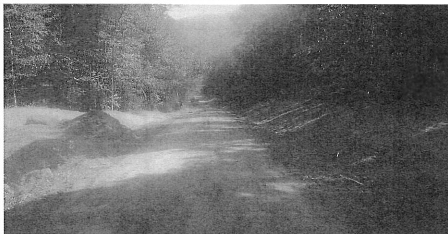
Better Back Roads BR0782 - Snow Hill Project