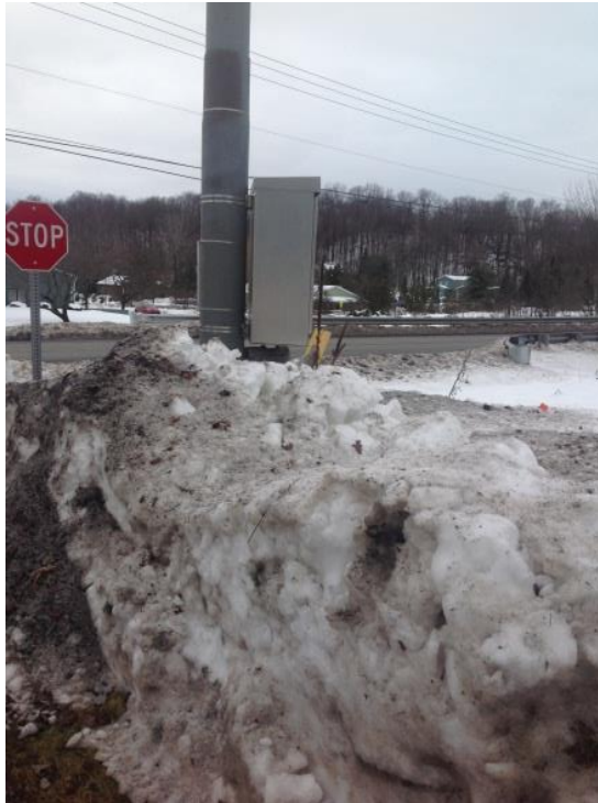
Figure 14: Control box in the winter.