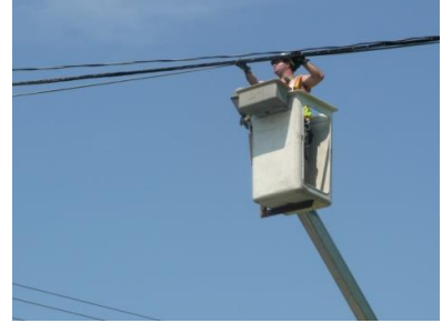
Figure 11: Running the wire across intersection.

The site was visited in both dry and wet conditions. The system and control box was checked and the system appeared to be operating properly. Since this installation there have been two more installations of the Wavetronix® Stop Bar Detection system in Vermont. One is located at the intersection of US Route 7 and Bostwick Road in Shelburne and the other is at the intersection of VT 104 and St. Albans State Highway off from Interstate 89 Exit 19 in St. Albans. There were two reported incidents where the system failed due to the amount of wind and snow causing temporary white out conditions, leading to the radar device losing track of the moving vehicles through the intersection, effectively maximizing green cycle time. The first incident occurred at the St. Albans location in the winter months of 2011. The second was at the Hinesburg location in December 2014. For both instances a signal technician was dispatched to the sites and the signals were reset and restored to proper working conditions.