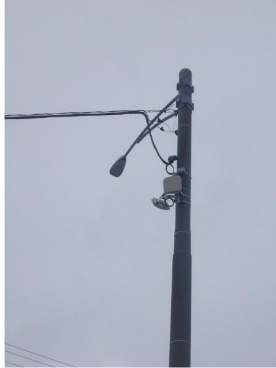
Figure 13: Traffic sensors on pole.