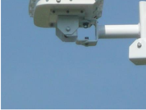
Figure 4: Mounting brackets.