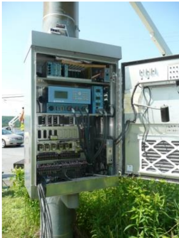
Figure 3: Control box.

The brackets to attach the sensors were mounted on the utility poles. Each bracket was mounted at least 17 feet up the pole to avoid the power lines in place. Two brackets were mounted to each pole and were secured by two metal bands, one tightened on the bottom and one on the top. Two electrical boxes were mounted next, one over each bracket. These were also secured with metal bands. The brackets and electrical boxes are shown in Figure 4 and Figure 5 below.