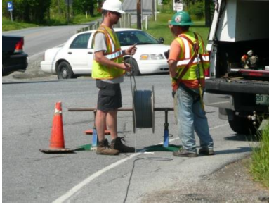
Figure 9: Measuring wire.