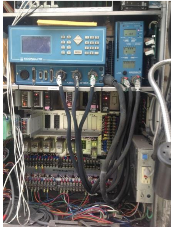
Figure 15: Inside the control box.

For the purpose of this analysis, VTrans 2000-2014 crash data was utilized to perform a cross sectional analysis of the VT 116 and Shelburne Falls Road/CVU Road intersection prior to and following the installation of the Wavetronix® Smart Sensor Matrix™. Various potential explanatory variables for each crash including weather conditions, time of day, time of year, type of crash, and reason for each crash was examined to determine any changes in the number of crashes, injuries and fatalities before and after the Wavetronix® system installation.