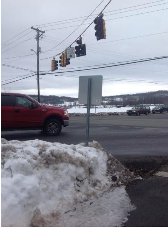
Figure 12: Intersection traffic and lights.