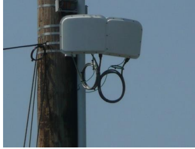
Figure 10: Connecting wire to sensor.