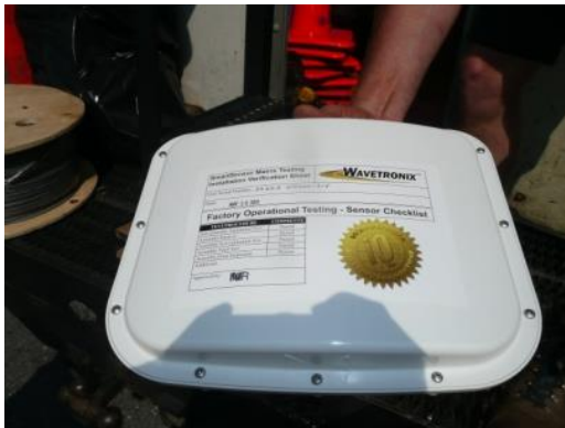
Figure 1: Traffic facing side of sensor.

According to product literature, the SmartSensor Matrix™ system is comprised of four radar detection units. Ideally they would be installed in two corners of an intersection to allow for 90° field of view so that when vehicles enter the user-defined zones the controller will detect their presence. Each detection box measures 13.2 in. x 10.6 in. x 3.3 in., weighs 4.2 lbs, and is resistant to corrosion, fungus, moisture deterioration, and ultraviolet rays. Based on manufacturing techniques, the system is considered to be extremely low maintenance. Battery replacement, recalibration, cleaning, and readjustments are not necessary. The purpose of the system is to detect vehicles and extend the green light if the system detects the speed at which a vehicle is travelling would cause a conflict if they were to stop abruptly. This overhead system is also not susceptible to damage induced by frost heaves, rutting, and other pavement structure deformations as is the case for standard loop detection systems (4). The device is shown in Figure 1 and Figure 2 below.