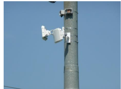
Figure 8: Sensors after positioning.