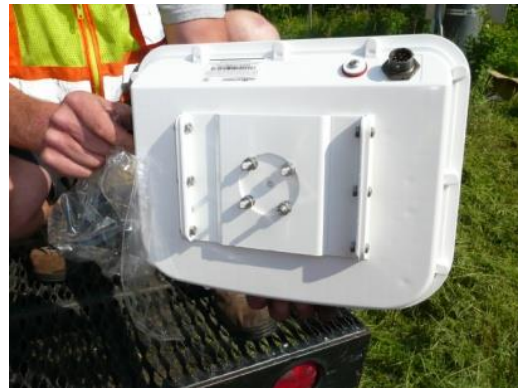
Figure 2: Pole facing side of sensor.