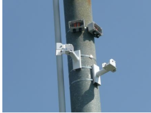
Figure 5: Mounting brackets and electrical boxes.

The sensors were then anchored on each mount. Each sensor is responsible for regulating a lane so they must be properly positioned to the correct lane. This is shown in Figure 6, Figure 7 and Figure 8.