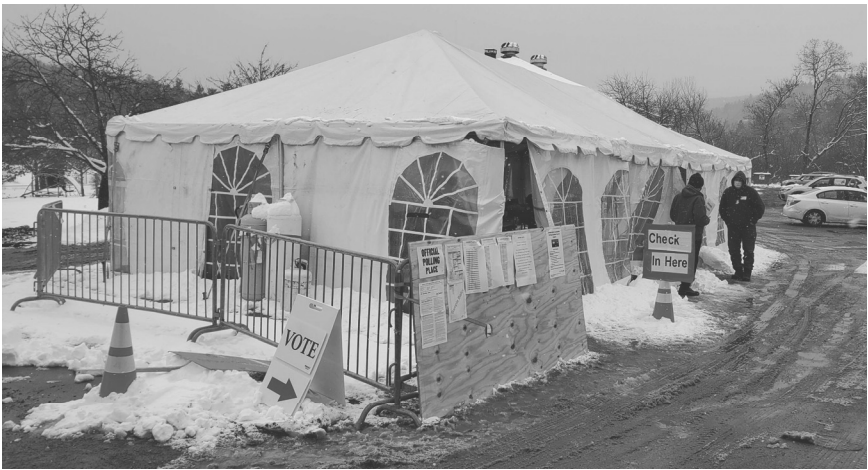
Voting Outside During the General Election