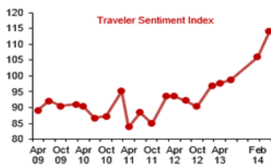
Traveler Sentiment Index