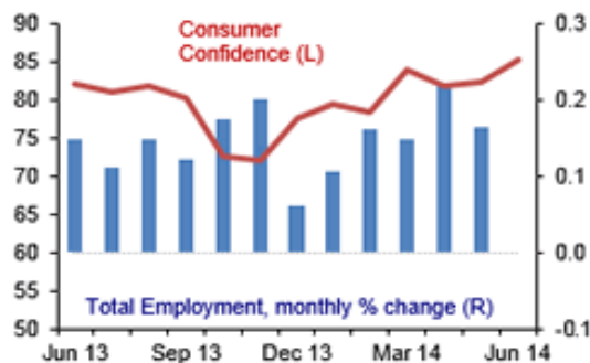
Employment and Consumer Confidence