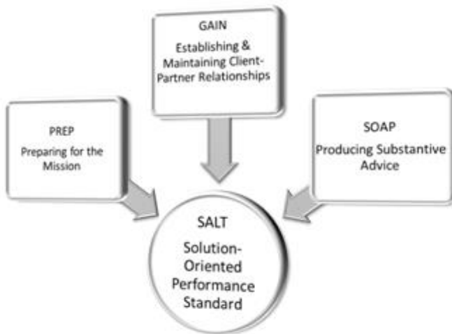
Figure 1. The SALT Performance Standard