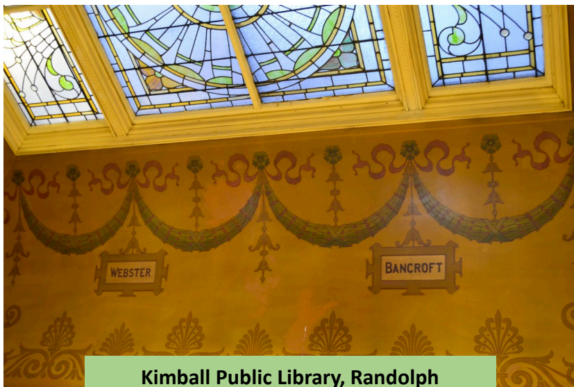
Kimball Public Library, Randolph