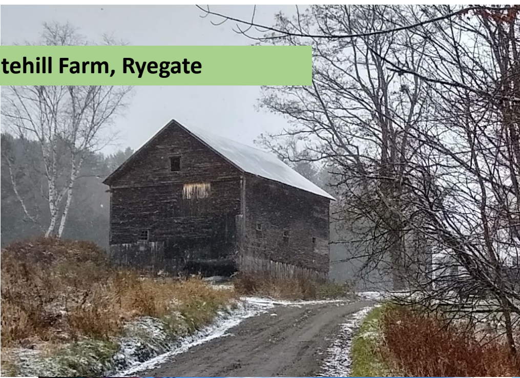
Whitehill Farm, Ryegate