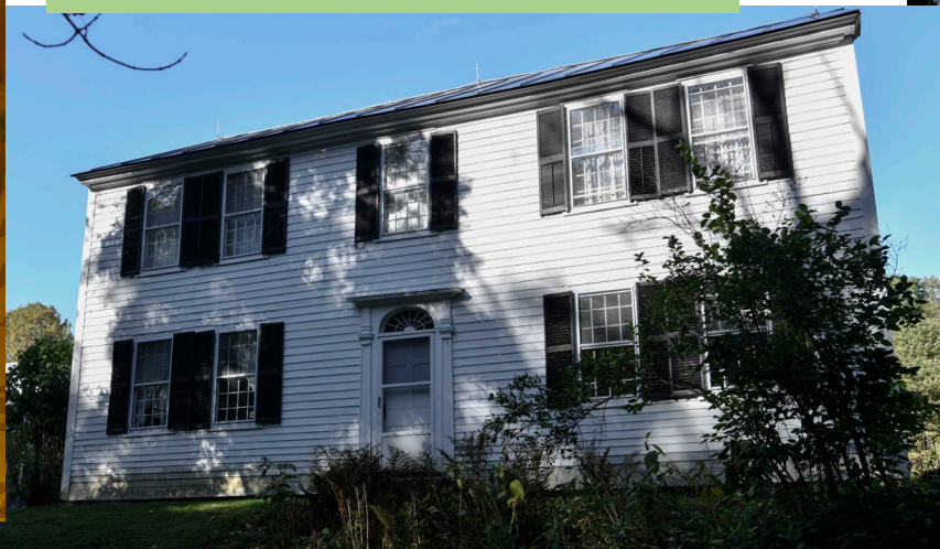
Reverend Dan Foster House, Weathersfield