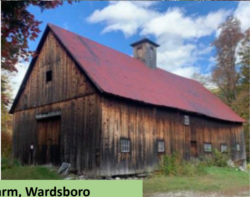
Brigg Farm, Wardsboro