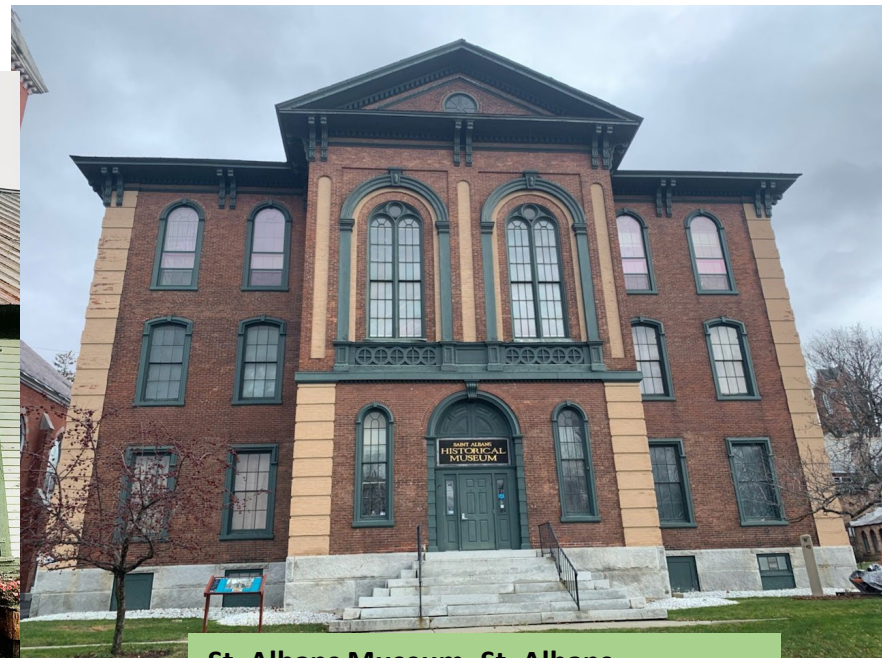
St. Albans Museum, St. Albans