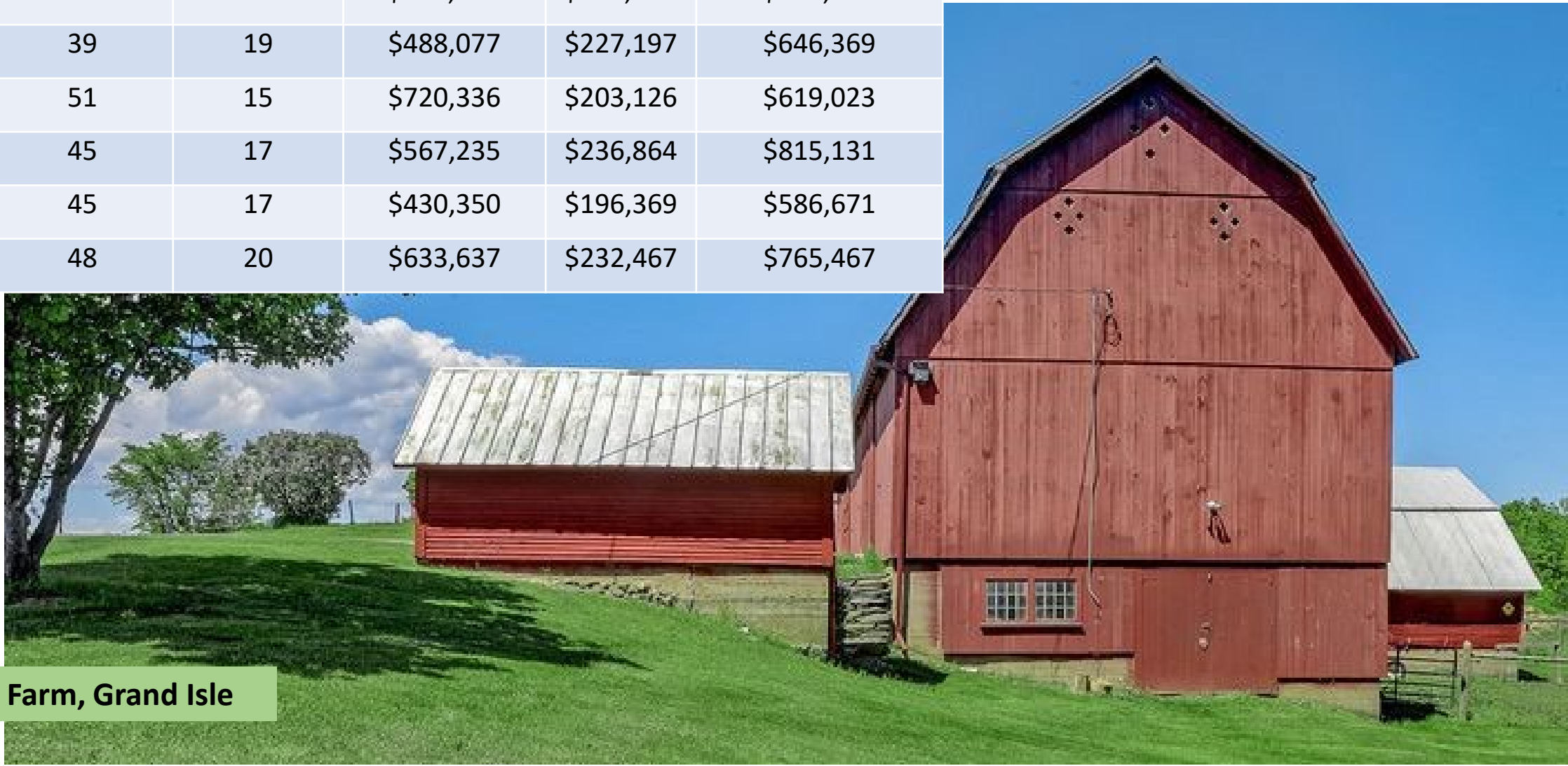
Pearl House Farm, Grand Isle