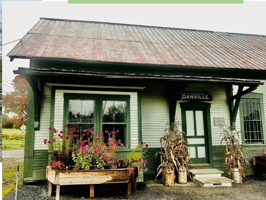
Train Depot, Danville