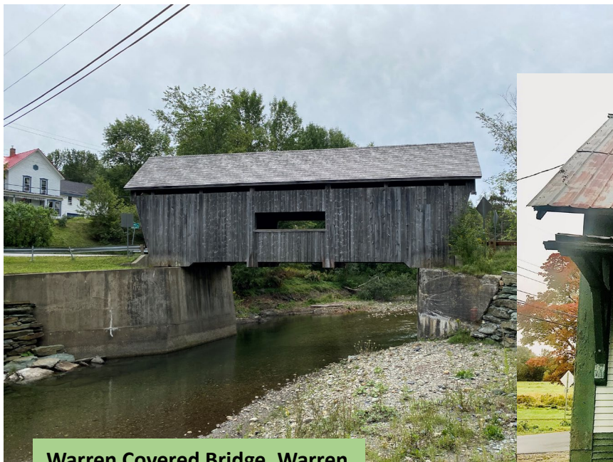
Warren Covered Bridge, Warren