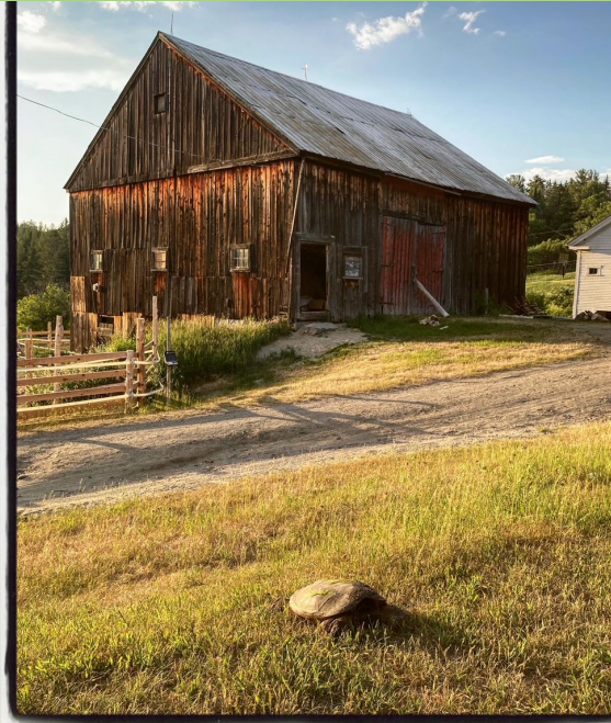
Peacham Hollow Farm, Peacham