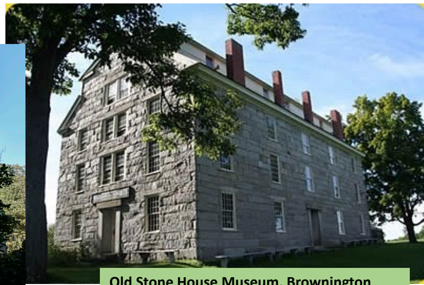
Old Stone House Museum, Brownington