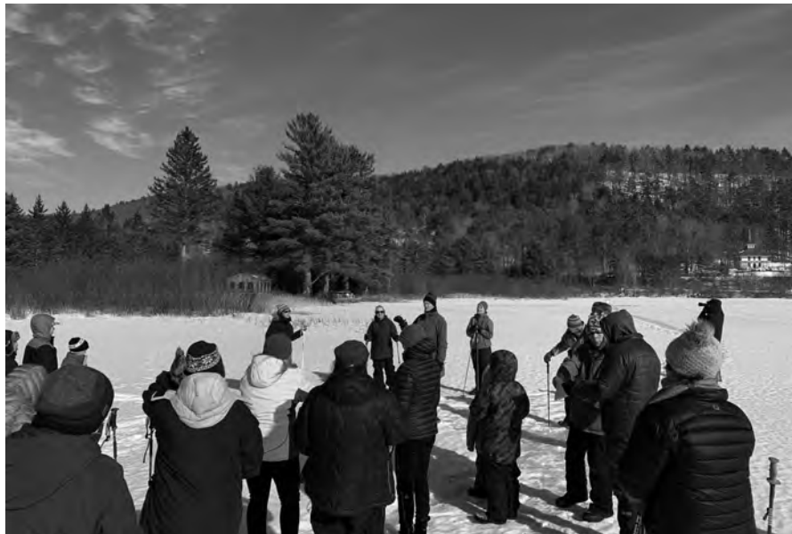
Winter Wander on Lake Fairlee organized by Conservation Commission

The West Fairlee Conservation Commission has had a busy year, much of it out-of-doors or on Zoom. This year, concern for local water quality has led CC members to focus on education about our watershed, wetlands, and Lake Fairlee.