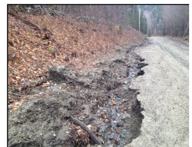
Implement relevant best management practice