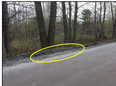
Removal of Grader Berm