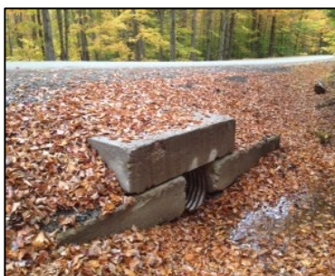
Culvert End Treatment

On hydrologically connected Class 4 Roads, with Gully erosion