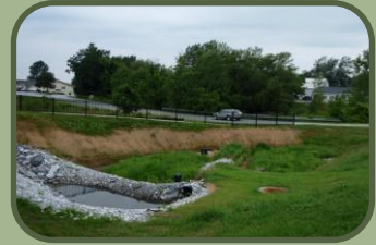
Constructed Gravel Wetland - St. Albans