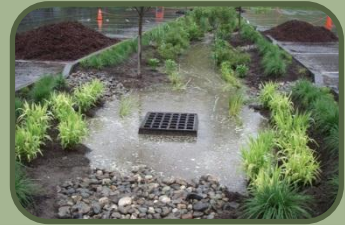
Bioretention - Montpelier