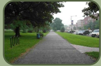
Pervious Pavement - St. Albans