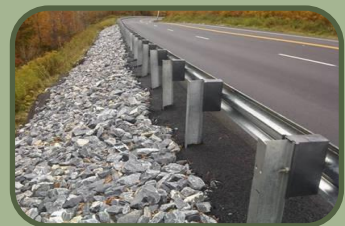
Roadside Curb Removal – Route 9