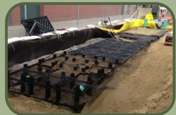
Silva Cell™ - Burlington