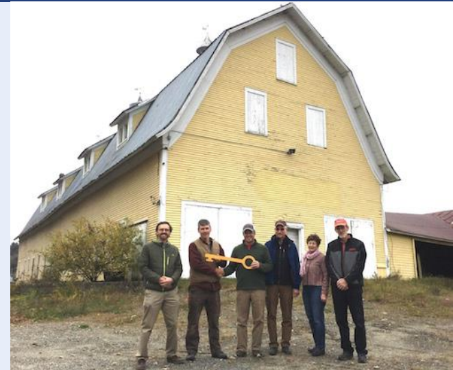
Yellow Barn Project, Hardwick $936,000 CDBG Implementation Grant