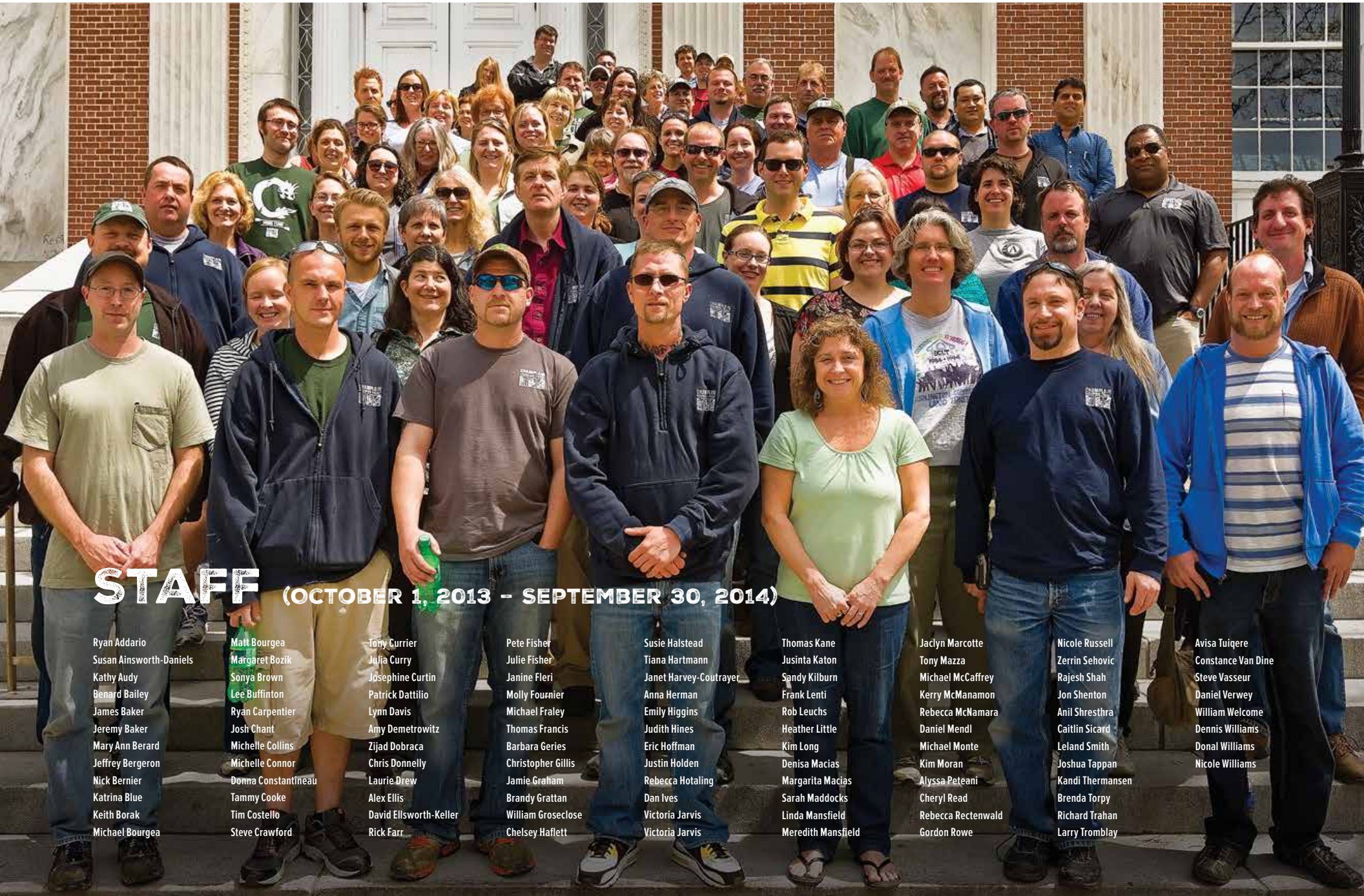
STAFF (OCTOBER 1, 2013 – SEPTEMBER 30, 2014)