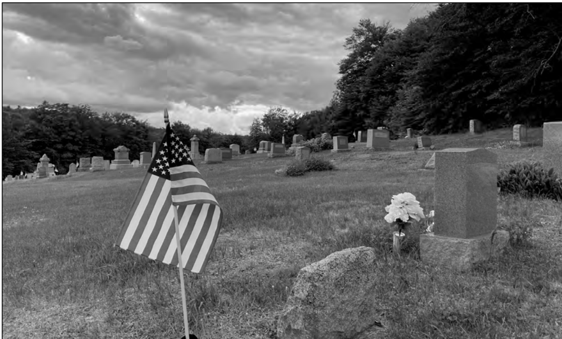
South Woodbury Cemetery