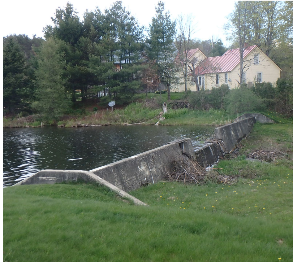
Little Hosmer Dam