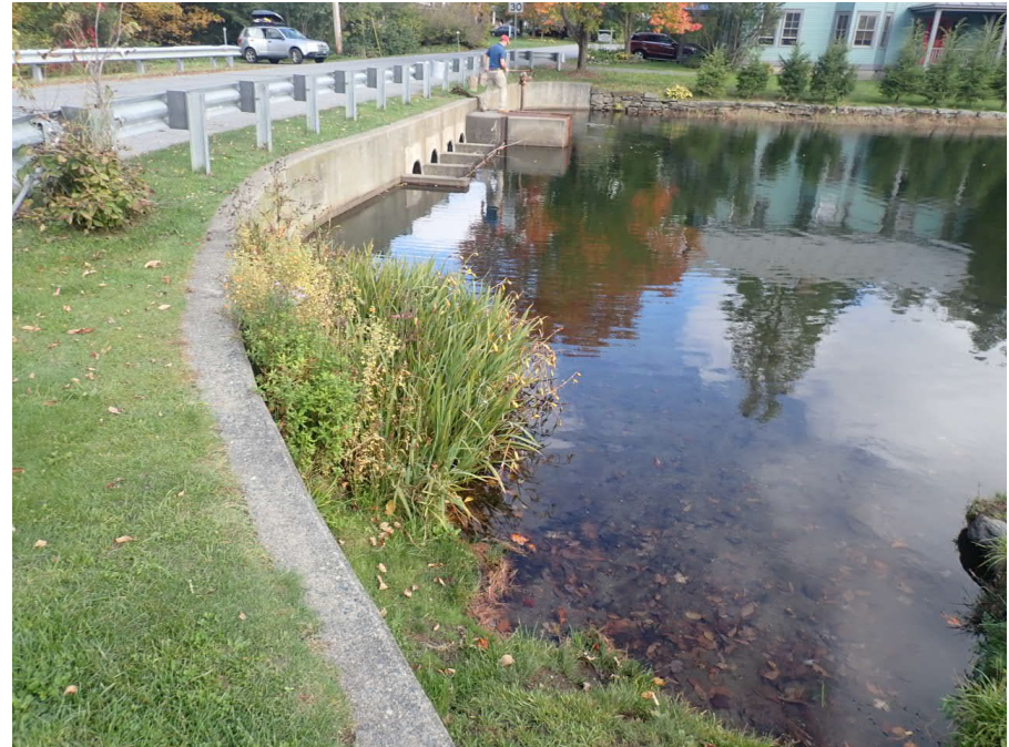
Silver Lake Dam