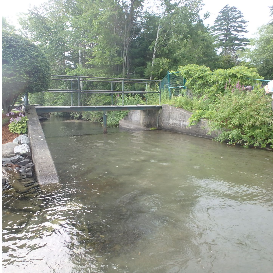
Lake Morey Dam